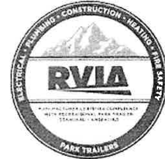
Example of Park Trailer Tag

The HUD manufactured home standard is intended for manufacturing facilities and is very difficult to apply to one-time construction.