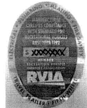
Example of RV Trailer Tag

Costs associated with this publication are available from the Division of Building Safety in accordance with Section 60-202, Idaho Code.